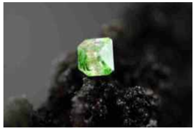
Smithsonite - Milton Lavers' Collection