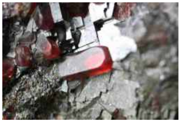
Rhodonite Crystal - Milton Lavers' Collection