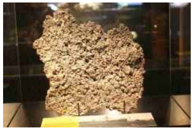
Nugget of Native Silver - Mining & Minerals Museum

The next stop was The Railway Mineral and Train Museum, followed by Albert Kersten Mining and Minerals Museum. This museum contains a 42 kg silver nugget, as well as several minerals found at Broken Hill named after people associated with Broken Hill (Raspite, Mawbyite, Hoganite and Paceite), and kintoreite named after the Kintore open cut mine, also Segnitite named after Ralph Segnit in honour of his research on Australian Minerals. Also at this museum is the famous Broken Hill Silver Tree (unfortunately no photos are allowed of the silver tree – the only object in the museum for which photography is forbidden). Many other minerals were also on display. This museum still has copies of the second edition of "Minerals of Broken Hill" for sale for $50 including postage within Australia.