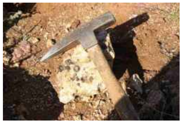
Searching for Gahnite