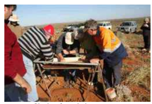
Sieving for gahnites

On the Friday we visited several areas – Hidden Treasure Mine, Great Western Mine, Nine Mile South Mine and a scheelite deposit. All these sites were about 5 to 10 Km along the Broken Hill to Silverton Road. At the Hidden Treasure Mine we searched for and found gahnites. Gahnite is a zinc aluminium spinel (ZnAl<sub>2</sub>O<sub>4</sub>, compare to normal spinel which is MgAl<sub>2</sub>O<sub>4</sub>), which occurs here as small black octahedral crystals (some of these are actually a very deep green), both loose and in matrix. Next we went to The Great Western mine where we found malachite and cerussite. The third location this day was the Nine Mile South Mine where we found more gahnite and also some garnets. The last location of the day was a scheelite deposit where everyone collected what they thought would be scheelite. We then returned to admire Trevor Dart's Collection which had a large section of Broken Hill minerals and a smaller section on minerals from other places. After dinner that night we checked the specimens which we suspected might be scheelite under a UV light – some of us were disappointed that some of the specimens that we thought were most likely scheelite did not fluoresce while other less likely specimens did fluoresce. Not everyone was convinced that all the minerals that fluoresced were scheelite.