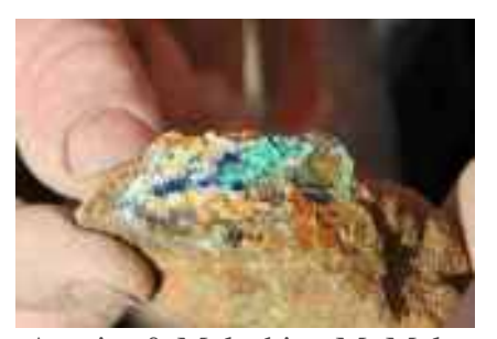
Dendrites, Mt Malvern