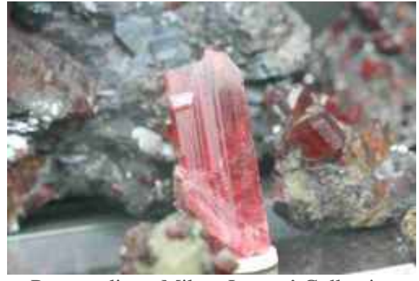
Pyrosmalite – Milton Lavers' Collection