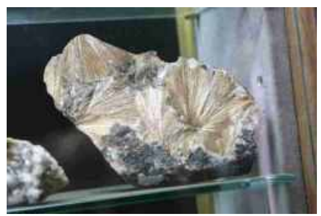
Inesite - Milton Lavers' Collection