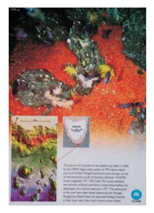
Crocoite needles photographed in 750 metres of water off Tasmania's coast. Maybe too far for a fossicking trip! From a display in the West Coast Pioneer Museum in Zeehan.