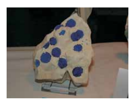
by Dehne McLaughlan were a feature of the show.