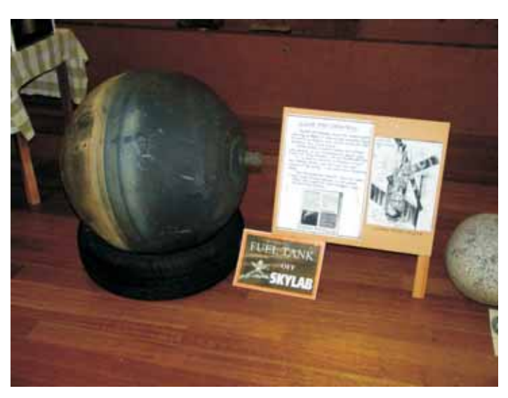
Another seminar, another Skylab! Following on from viewing the largeSkylab fuel tank at Mark Creasey's residence during the Perth joint seminar it was an amazing coincidence to see another Skylab tank, this time recovered after it was washed up on the West Coast of Tasmania!