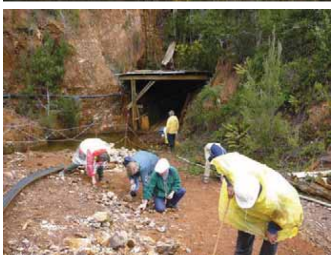
Entrance to the Adelaide Mine, with field trippers scrounging for crocoite