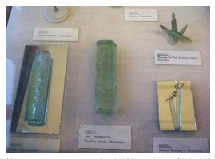
You can never get enough beryl – Display in the Geological Museum, Copenhagen; Brazilian specimen at left is 10cm in length

During our recent overseas trip we visited the Copenhagen Geological Museum. It is an extensive and well displayed collection, well worth a few hours to anyone travelling to Denmark. The lighting was unobtrusive and well placed to display the minerals to their advantage, quite unlike some of the museums we have visited.