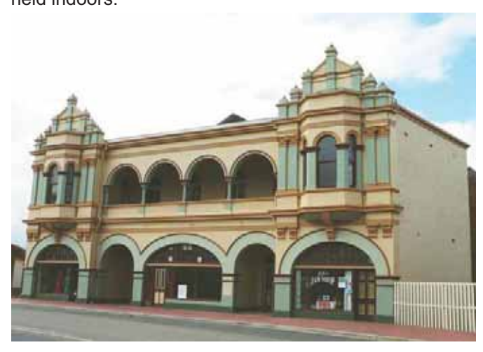
The ASJMA venue – Gaiety Theatre Zeehan. Below: Mt Bischoff Mine, Waratah Tasmania; Mt Bischoff was one of the early high-yield tin mines, now reopened by Metals-X, with ore trucked to the Renison Bell Mine to feed the concentrator.

The Zeehan Museum Mineral Display has been upgraded (just as well, as it was previously in an 'awkward' setting in the bowels of the Museum). The weather was variable; drizzly and overcast on Monday (Mt Bischoff Mine), but fined up for Tuesday (Adelaide Mine for crocoite and the stichtite quarry) and Wednesday (Queenstown/Mt Lyell Mine); Thursday to Sunday saw typical West Cost weather, showery, and rain, but fortunately, the Gem and Mineral Fair was also held indoors.