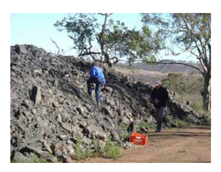
Collecting frenzy on the Toowoomba field trip – note dark

There was a brisk westerly blowing and it was pretty cold, about 14°C, but as everyone was well rugged up, I don't think anyone caught frostbite. We had a very pleasant few hours fossicking, and left the site a little after midday. Many thanks to Russell for organizing a thoroughly enjoyable and productive field trip.