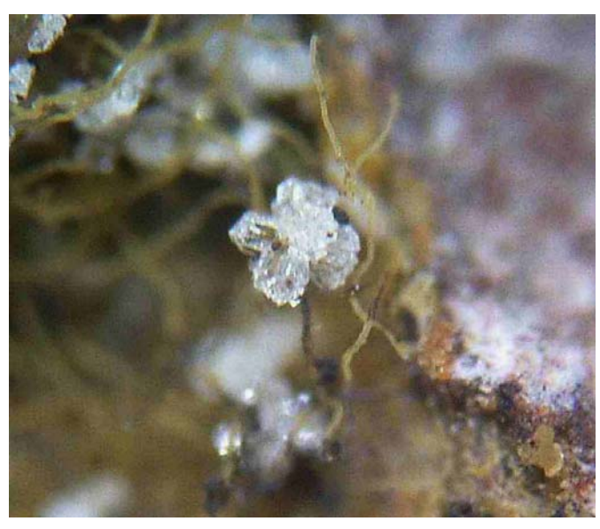
Tom's phillipsite sixling, approximately 0.9mm across the arms – Bedford St dump, Toowoomba

Philip and I were the only ones to stay overnight as Sunday was a monthly meeting for the Casino members. It was a night of riotous laughter and a day of eating. Those ladies know catering!