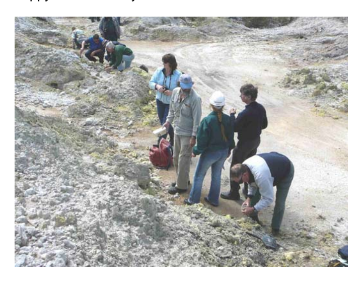
You can collect (above), but below, you can only take pictures and memories; Russell's photos

By now our cases had hit capacity so we spent Monday and most of Tuesday wandering around the Auckland area. The plane left at 5pm, bound for Brisbane. There were no hassles with Aussie immigration or customs, and we were through in almost record time. (We were bringing in mineral crystals, which are clean, and NOT rocks which are not clean). We were home by 7.15pm, happy but absolutely exhausted!