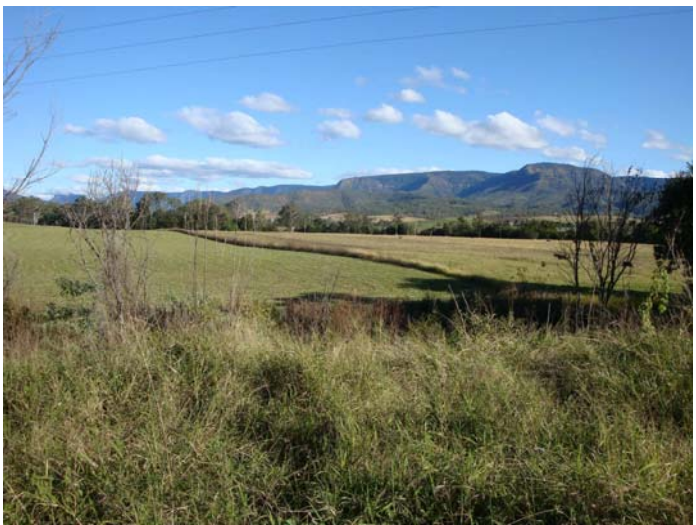
Above left: the end of a perfect field trip, at the Mt Kyoch Pilot Tunnel site, Toowoomba in background; at right, scene from the Laidley field trip – "There's zeolites in them there hills"